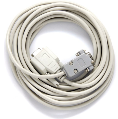
Fig. 1 910RS Serial Cable