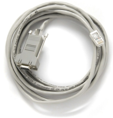
Fig. 1 810RJ Serial Cable for VCM-D1