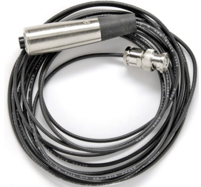
Fig. 1 710R Shutter Interconnect Cable