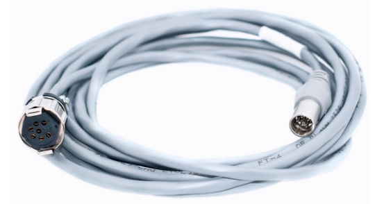
Fig. 1 710A Shutter Interconnect Cable