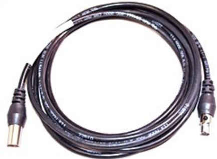
Fig. 1 510A Shutter Interconnect Cable